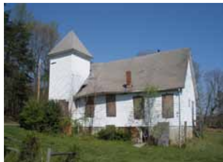
St. John's AME Church in the Delaney Court neighborhood of Roanoke County.

Visit us on the web for complete information on each of this year's endangered sites.