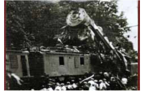
Wreck of Virginian #3 at Ingleside.