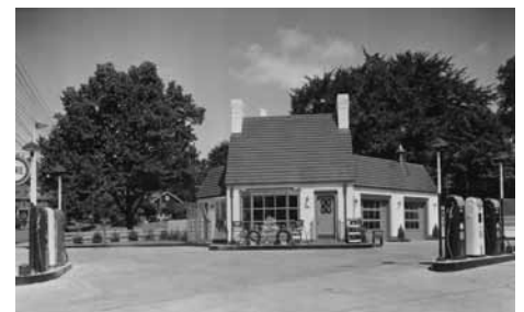
Pure Cottage Station

partner with the Virginia Museum of Transportation (VMT) in celebrating the history of the gas station in Virginia as we look towards the 100th anniversary