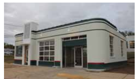
Carlin's Amoco Station

presentation on historic stations in Roanoke at our annual meeting on November 29 at the VMT. The Foundation and VMT will begin working on a larger exhibit documenting the development and role of the gas station throughout Virginia to open in December 2013.