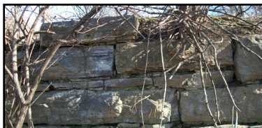
19th Century Stones