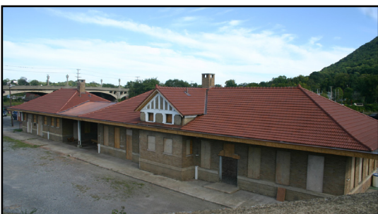
Virginian Railway Station (current state)

The restored Virginian Railway Station will be used for offices and collection/exhibit space for the RCNRHS in the former Baggage Express building while the Passenger Station will be leased to a commercial tenant. Income from the leased space will be used to maintain the building. A memorial wall will be incorporated into the site to honor the former employees of the Virginian Railway. The building will also provide amenities for the nearby greenway.