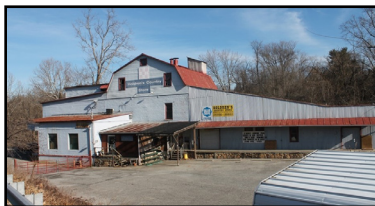
Holdren's Country Store