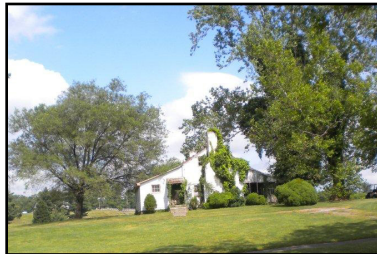
Ole Monterey Golf Course Cabin