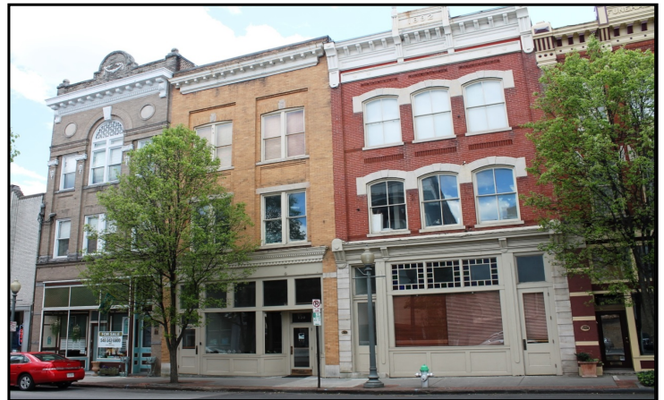
These three significant buildings at 118-124 Campbell Avenue SW, in Roanoke's Downtown Historic District were placed under preservation easements in the 1990s.

The RVPF advocates the donation of preservation easements for significant historic properties owned by municipal governments such as the City of Roanoke, especially those properties that are slated for transfer into private hands, in order to protect the city's heritage from potentially undesirable actions that would impact or destroy its historic landmarks. Because the process of donating an easement takes time, it is essential that a forward-looking, proactive approach is taken. To learn more about preservation easements, visit http://dhr.virginia.gov/easement/easement.htm .