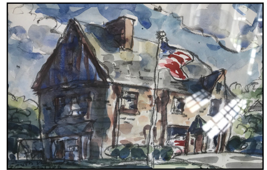
Crystal Spring Firehouse Painted by Brett LaGue

The RVPF has supported an individual's proposal to buy the wooded area adjacent to the former Shenandoah Life Insurance home office to save it for walkways and other environmental uses. Carilion Clinic bought the building and announced plans to develop the wooded area for residential use, but strong neighborhood opposition arose. Since the area is located next to a greenway and Fishburn Park, its natural setting provides clean air, natural habitat for wildlife and recreational opportunities for nearby residents. Recently, a move was reported to encourage the developer to either make it a community-friendly project or to pull out of the project all together.