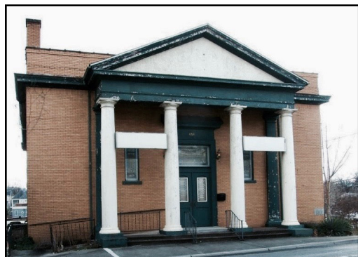
Christian Science Church pre-renovation