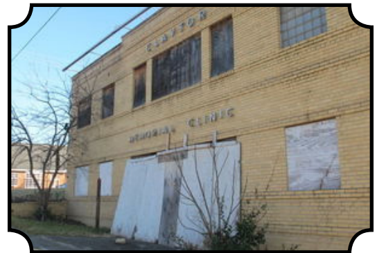
Claytor Memorial Clinic

The RVPF works to promote awareness and appreciation of significant historic, natural, and cultural resources, and facilitates their preservation whenever possible. The 21st selection of endangered sites will be made in the spring; awards for restoration and rehabilitation will be announced at the annual meeting on Nov. 15. For more information on endangered sites, including a full list of successes, losses, and continued projects, please visit the RVPF website.