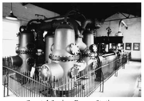
Crystal Spring Pump Station

Museum, the Botetourt County Historical Museum, the Vinton Historical Society Museum, the Crystal Spring Pump Station, or the Salem Museum & Historical Society. We can't preserve what we don't understand or appreciate!