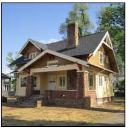
1222 Campbell Avenue

Visit us on the web for complete information and photographs on each of last year's Preservation Awards.