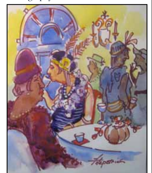
Watercolor sketch of the Premiere Party by local artist, Eric Fitzpatrick.

Celebrate, from Page 1 monuments, and routes including the Blue Ridge Parkway, Jefferson National Forest, the Appalachian National Scenic Trail, and the Booker T. Washington National Monument. These designated areas preserve our beautiful natural resources and are historic too!