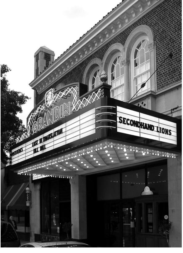
LOST, SAVED, STILL ENDANGERED: Clockwise from top left are, the Brubaker Farm, the Grandin Theatre, the Adams, Payne and Gleaves Livery Stable and the old Virginian Station. The Brubaker Farm, in Hanging Rock, has been bulldozed. The Grandin, in Roanoke's Raleigh Court neighborhood, has been restored. The livery stable and railway station, on opposite sides of the bridge where Jefferson Street crosses the railroad tracks near Virginia Scrap Iron and Metal, are still endangered.

the foundation's Endangered Sites and Awards Committee has searched past selections to compile a listing of lost sites,