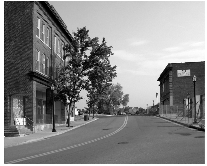
Looking north on Henry Street: The three-story, 70,000 squarefoot Social Security building would go in the next bock, behind the building on the left. Henry Street would be closed to traffic at that block.

70,000-square-foot federal building to go at the intersection of Henry Street, Wells Avenue and Second Street. The project calls for closing Henry Street to provide a 50-foot security buffer around the building. The street closing requires formal action by the City of Roanoke.