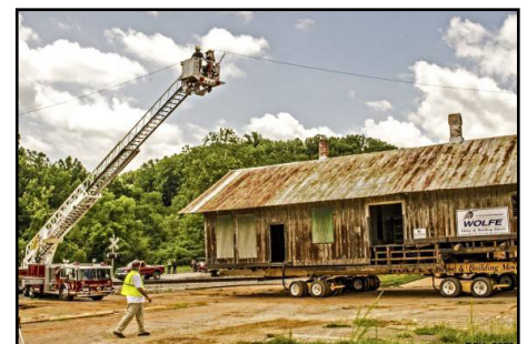
Firemen raise power lines to give clearance as the station is moved to its new location.

Facebook page, ‘Restoring the Boones Mill N&W Railroad Station’.