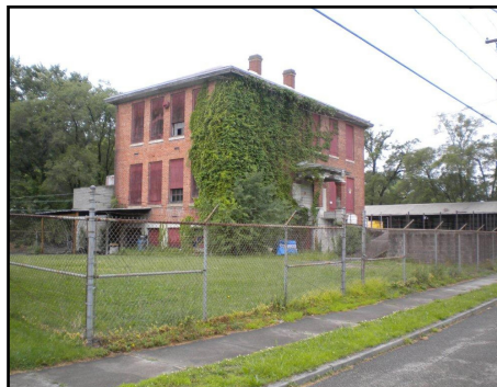
Norwich School on Roanoke Avenue in Southwest Roanoke City.

For more information on each of these awards, visit us on the web at www.roanokepreservation.org .