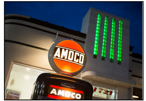
Carlin's Amoco Station.