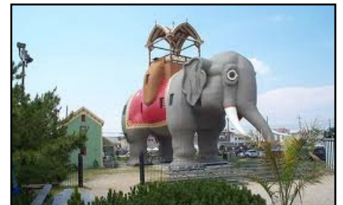
Atlantic City's Lucy the Elephant.