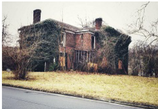
Riverdale c. 1874 in SE Roanoke was demolished April 25, photo courtesy of Sherry Lucas

As RVPF considers nominations for its annual list of Endangered Sites and continues to advocate for saving Fire Station No. 7, we ask questions regarding what we consider to be a threat and when is it best to raise the alarm? Our ultimate goal is to raise public awareness about significant sites that are threatened and effect positive change when possible. In most cases, inclusion on the annual list is intended to accomplish this rather than to chastise an owner. With this in mind, does the fact that a building is vacant and has an uncertain future warrant inclusion on the Endangered Sites List or should we wait for a more definitive and eminent threat? When is it too late to effect change? Join us at our next Preservation Pub Talk on Wednesday, May 16 at 6:30 at the Green Goat to have a meaningful discussion on this topic.