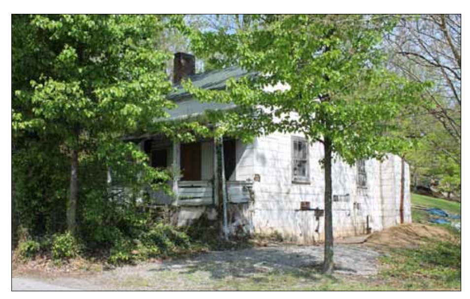
Current condition of Tanyard House.

Recommended Action: Roanoke College should preserve the building as it is a significant piece of Salem's history. It could also serve as a teaching tool and project for students interested in historic preservation.