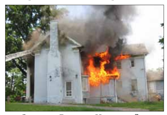
Compton-Bateman House on fire.