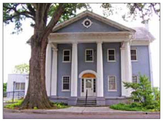
Compton-Bateman House prior to fire.

Recommended Action: In order to adequately protect this property, a preservation-minded buyer with an appropriate rehabilitation plan and end use would need to acquire the building. Proposals to the City must include details of the intended use, the proposed terms and conditions of purchase, proposed method of financing, and proposed purchase price.