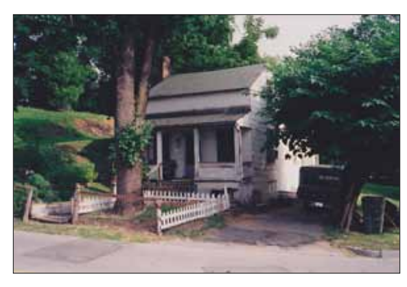
Tanyard House in 1996.

Threat: When first listed, the Tanyard House was owned by the Burke family who resided in Monterey. Their intention was to preserve the building and protect it from the pressures of encroaching development. However, since Roanoke College acquired the property in 2002, the Tanyard House has been neglected. It is