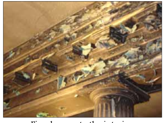
Fire damage to the interior.