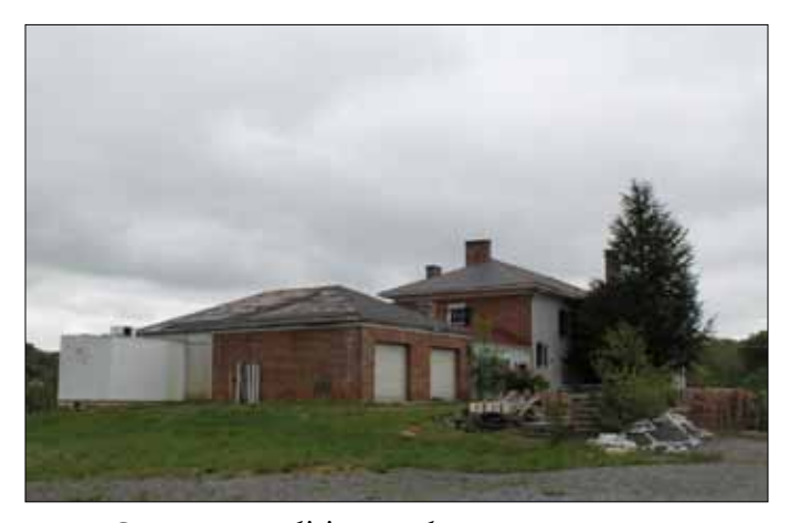
Current condition to the Denton House.