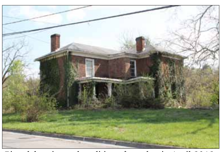
Riverdale prior to demolition of porches in April 2013.

Recommended Action: Riverdale is a rare example of a Civil War period brick house. A survey conducted for compliance with Section 106 in relation to the demolition of