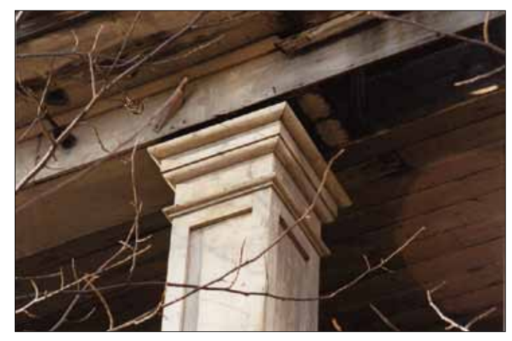
Condition of the Roanoke Red Sulphur Spring Cottage in 2002.