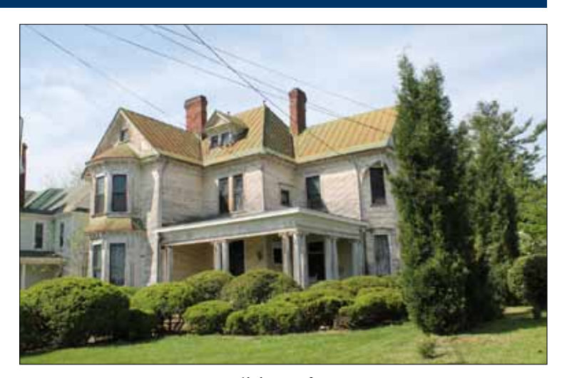
Current condition of Hester House.

This section of Union Street is an intact block of well maintained Queen Anne homes.