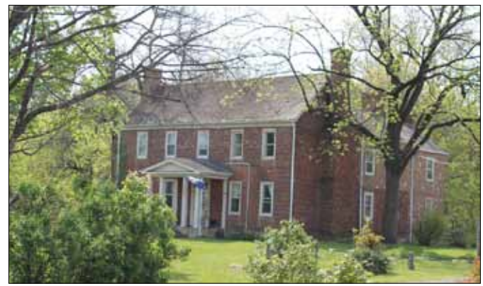
Current condition of the Preston House.

Recommended Action: In 1999, the RVPF suggested the house be used as a bed and breakfast or welcome center to historic Salem due its proximity to I-81. These are still viable options. The land associated with the house should also be preserved to retain its remaining context and potential archaeological deposits from encroaching development.