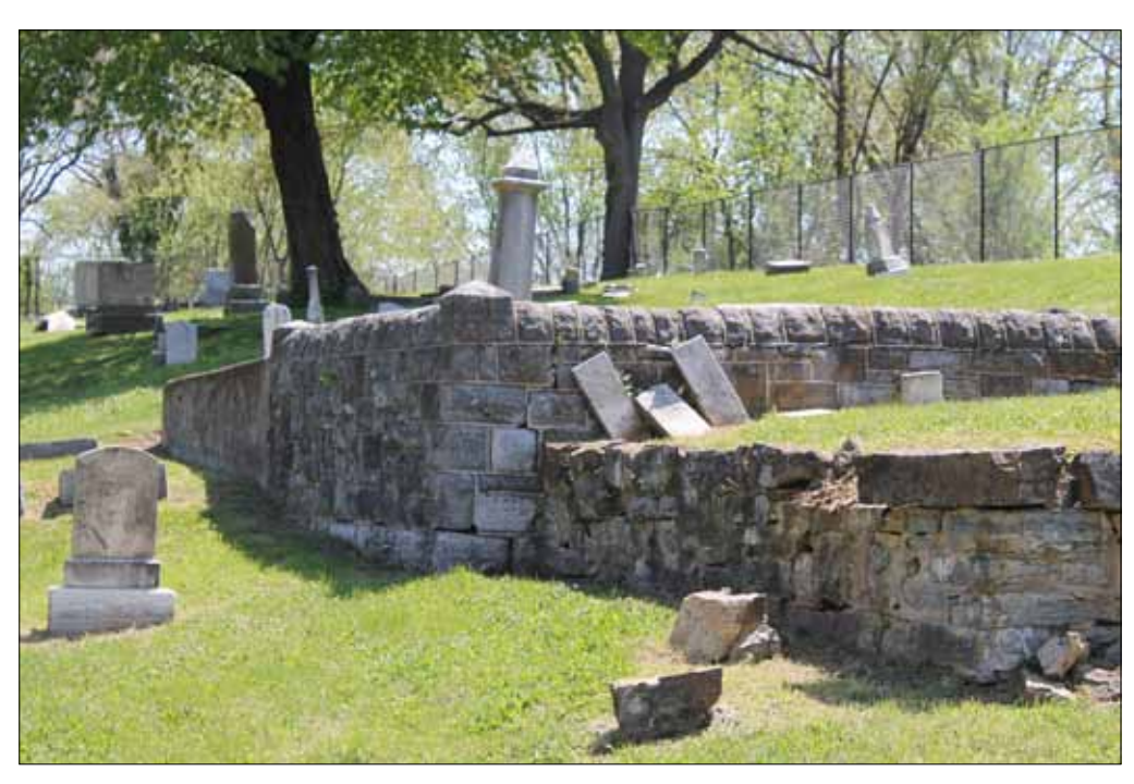
Current condition of City Cemetery.

Threat: Many of the headstones have been pushed over, broken, or removed by vandals. There are also urination stains on several headstones left by people using